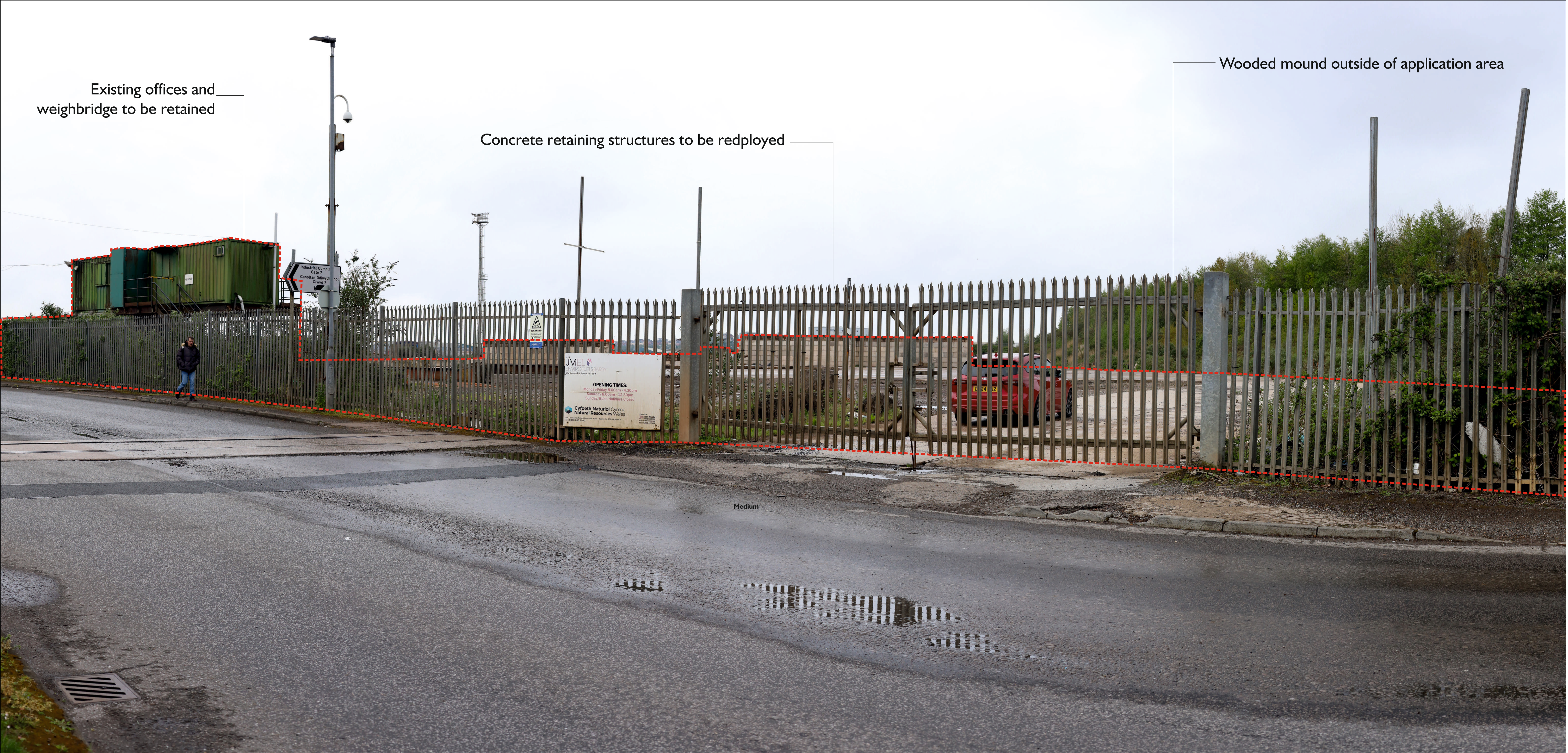
Representative Viewpoint 8 - Looking southwest from Wimborne Rd by the Site entrance